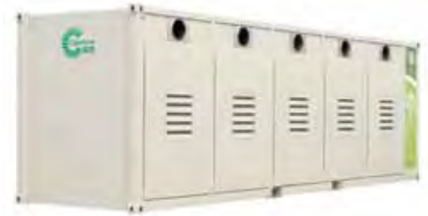
C600 Power Package